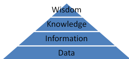
Table 1: The DIKW Pyramid

In the foreign language classroom, we should refer to an innovative approach to learning called Data-Driven Learning (DDL) which is actually gaining ground in foreign language teaching. While the core of most approaches lies in the teacher-guided learning and textbooks, in data-driven learning students are encouraged to treat language as a large data hub where they can carry out a great variety of discovery tasks on their own. In this context, many language teachers take high the principles of the DIKW pyramid- an underpinning concept which refers loosely to a class of models for representing structural and functional relations between the four levels: data, information, knowledge and wisdom. "Typically information is defined in terms of data, knowledge in terms of information, and wisdom in terms of knowledge" (EJ, pp. 163-180):